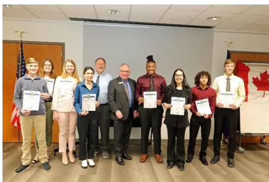
Entire Group of Contestants