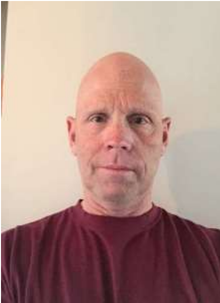
Governor Greg Kuhn