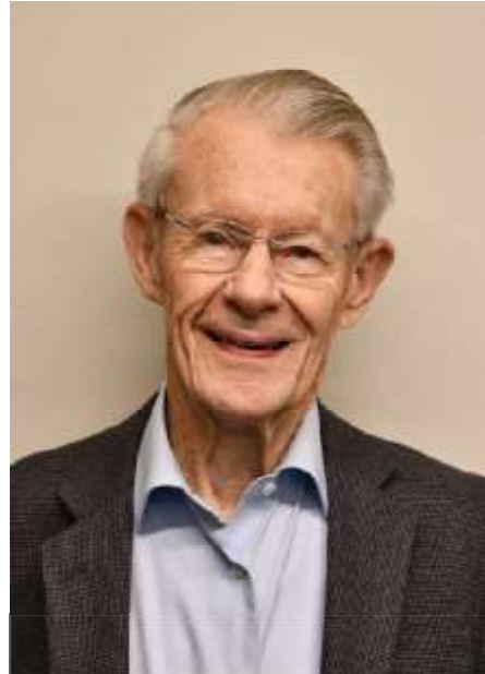
Governor Elect Walt Wilms