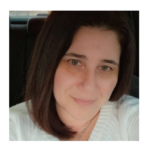
Governor Elect Monica Wallace